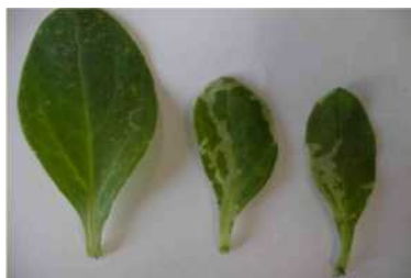
Fig. 2 Liriomyza huidobrensis (Blanchard) in Petunia