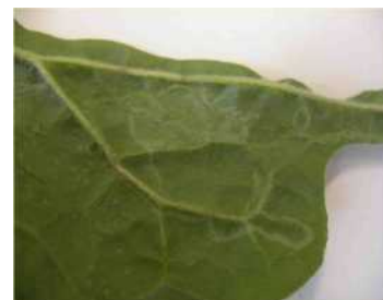
Fig. 3 Liriomyza huidobrensis (Blanchard) in Gerbera