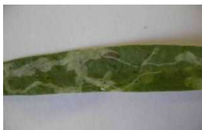
Fig. 1 Liriomyza huidobrensis (Blanchard) in Gypsophila

The State Plant Protection Service carries out the survey for quarantine pests in the glasshouses. During 2005 it was discovered a big quantity of Liriomyza specimens. The aim of this investigation was to determine pest species.