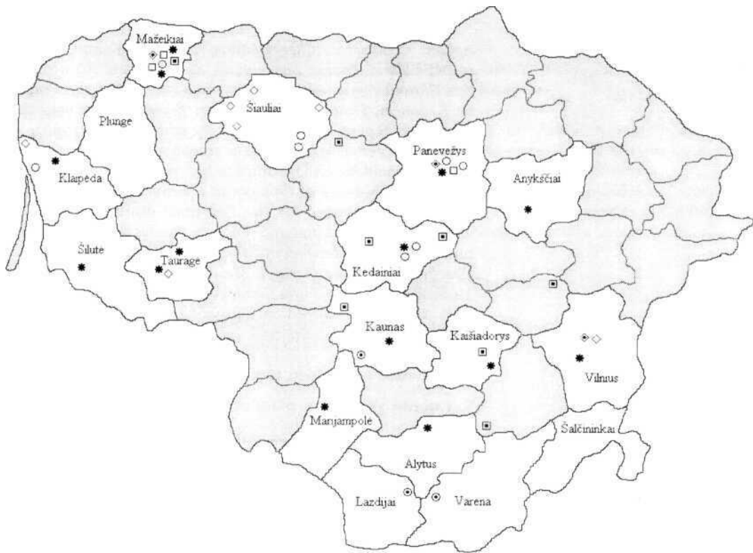
Fig. 1. Districts of Lithuania investigated in 2001-2002.

Hasted reactivation method. Dipterous, whose imagos did not emerge at the laboratory up to the first days of October, have been considered to winter diapause fallen. Tubes containing these insects were taken to the open air and kept in a box, in the shade, under natural conditions. There were two meteorological limits fixed in the storage. A first